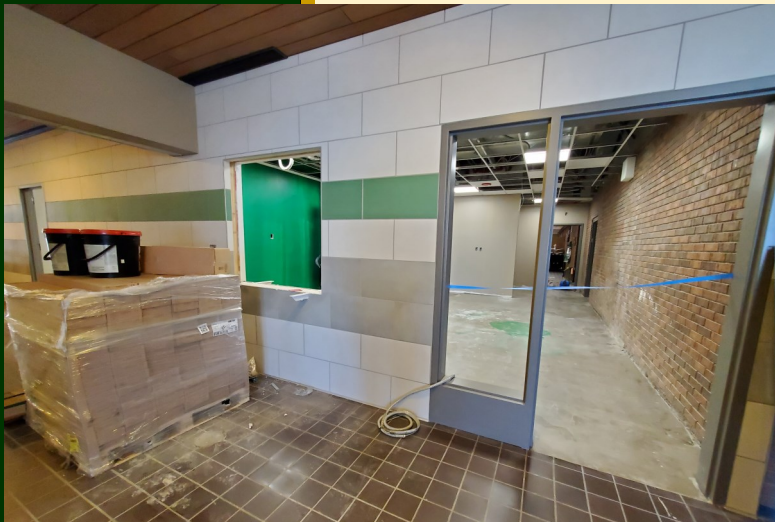
The Main Office, above, is the secure point of entry for the building. Visitors must go to the reception window to be buzzed into the locked interior foyer doors, or to be buzzed into the office.

This is the upper section of the area that will restrict open access to the main section of the Middle School. There will be locked doors here and a wall of windows. To gain access, one must go to the reception window in the foyer, which is partially visible on the right side of this photo).