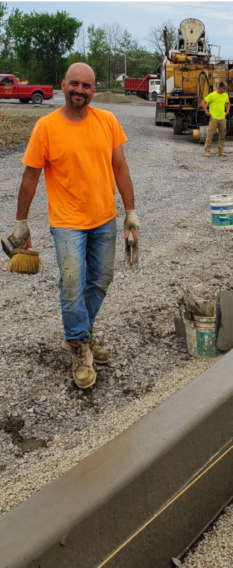
New sidewalks and curbs will surround the school, replacing those that deteriorated and shifted over the years.